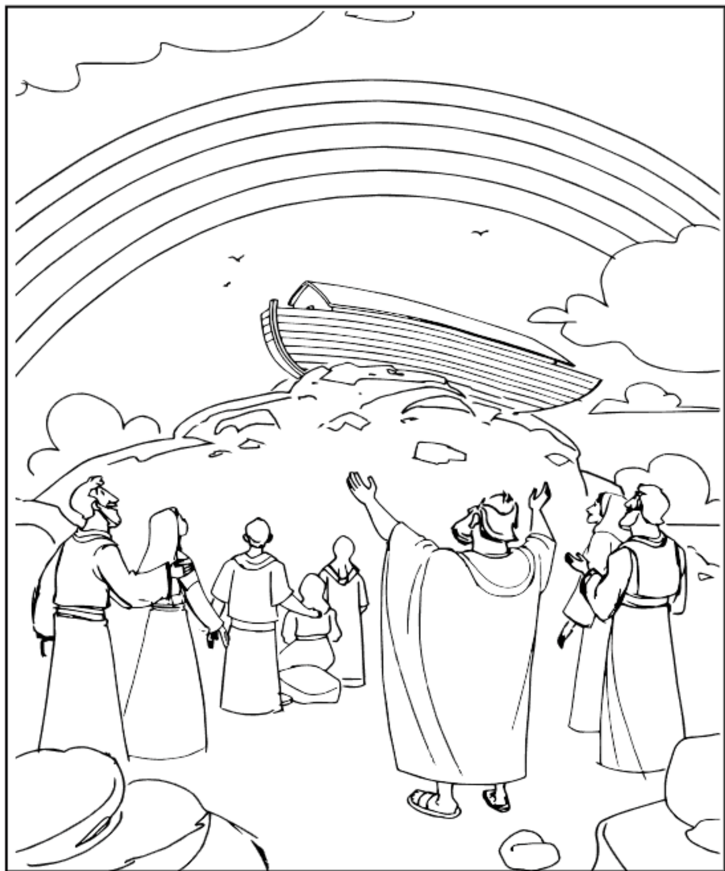
God made a promise to Noah.