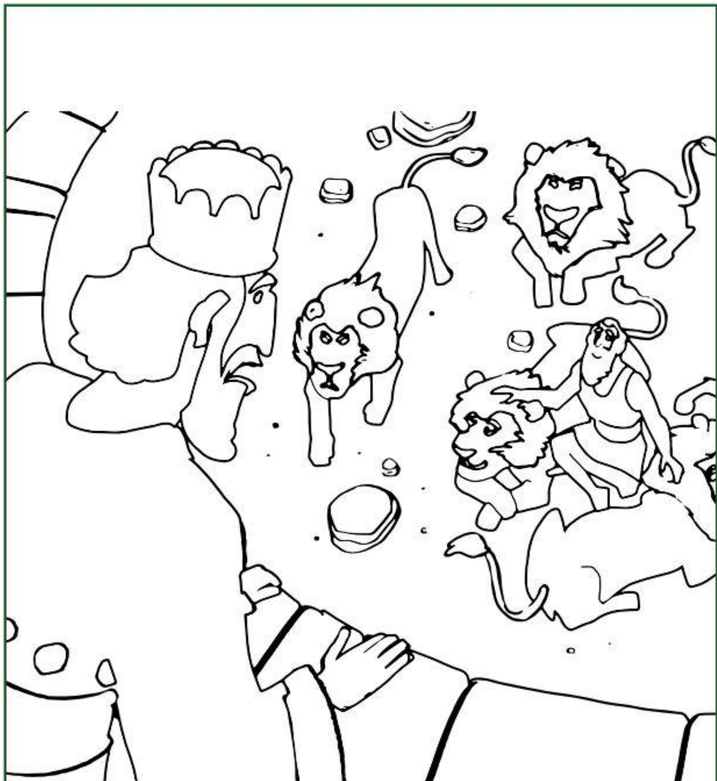
Daniel in the lion's den